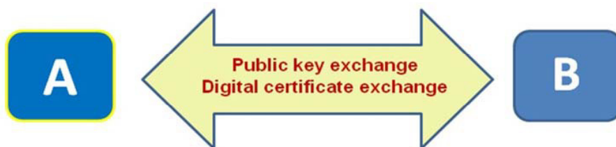
Fig. 2. SSL Architecture

SSL is well-known Internet protocol which acts as a secure channel between two nodes. Since 1994, SSL has become the world's most popular security protocol. SSL is having three versions: 2, 3 & 3.1. The most popular is version 3. SSL is basically used to exchange public keys & digital signature between two nodes in a secure manner. Thus both confidentiality & authentication services are offered by SSL. The general concept of SSL is shown in fig. 2.